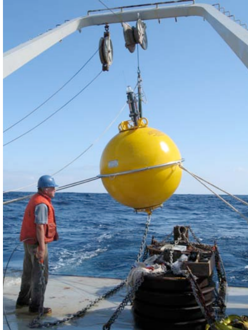
Fig. 4. Subsurface float used to support the DVLA mooring.

The motion of the DVLA and source moorings due to ocean currents will be measured using long-baseline acoustic navigation systems. Four acoustic transponders will be deployed around the DVLA, approximately 3500 m from the mooring and 3 m above the seafloor. Three acoustic transponders will be deployed around each WRC source mooring, again approximately 3500 m from the mooring and 3 m above the seafloor. All equipment, except for the mooring and transponder anchors, will be recovered at the completion of the experiment.