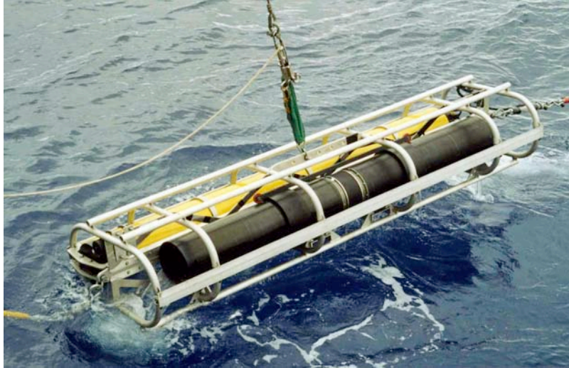
Fig. 1. WRC swept-frequency acoustic source, with integrated STAR controller and data acquisition system.

The seventh mooring will be a Distributed Vertical Line Array (DVLA) acoustic receiver developed at the Scripps Institution of Oceanography. The DVLA receiver is designed to record low-frequency acoustic signals, including those transmitted by the WRC sources, other acoustic sources, and ambient noise. The DVLA receiver employs a novel approach using distributed, self-recording hydrophones (Hydrophone Modules) with timing and scheduling provided by a small number of D-STAR (DVLA-STAR) controllers, which are specially modified versions of the STAR controllers and data acquisition systems. The DVLA will be modular, made up of five 1000-m long subarrays, each of which has one D-STAR controller and roughly 30 distributed, internally-recording Hydrophone Modules. A D-STAR controller will be shackled in-line at the top of each subarray. The Hydrophone Modules will be clamped to the wire rope at the time of deployment, making the DVLA readily configurable for different experiments (Fig. 2).